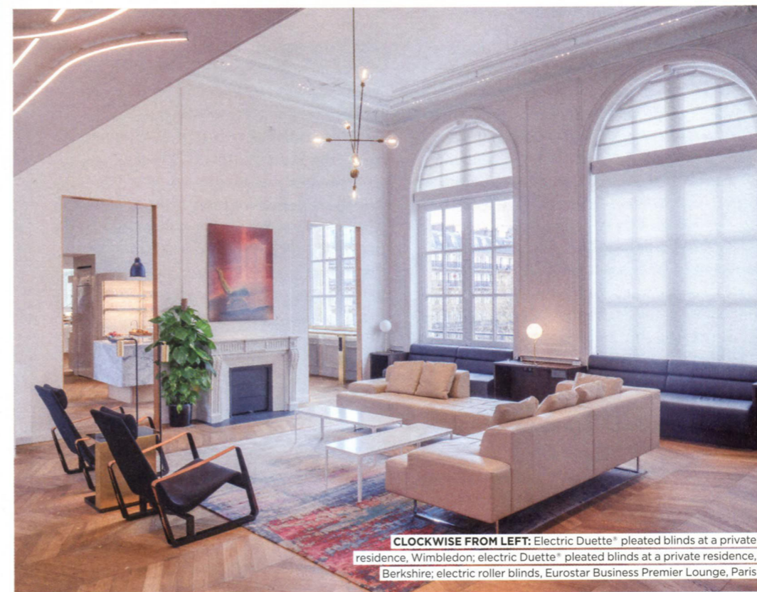
CLOCKWISE FROM LEFT: Electric Duette® pleated blinds at a private residence, Wimbledon; electric Duette® pleated blinds at a private residence, Berkshire; electric roller blinds, Eurostar Business Premier Lounge, Paris

By definition, each project is bespoke and needs a one-off response that is tailored to suit both the needs of the customer and the geometry of the glazing in question